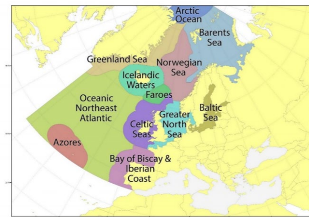
Figure 2 Map of ICES ecoregions.

Ecoregions are the spatial units used to develop and synthesize the evidence for the ecosystem approach (see Definition and rationale for ICES ecoregions ). They enable ICES to monitor, assess, and address regional scientific challenges and are used for geographical allocation and reporting of ICES advice. Ecoregions were developed using biogeographic, oceanographic, ecological, and human impact/management issues. Ecosystem services and effects assessments need to consider a range of spatial scales, both within and across ecoregions, and to elaborate a rationale for the choice of spatial scale used when providing advice.